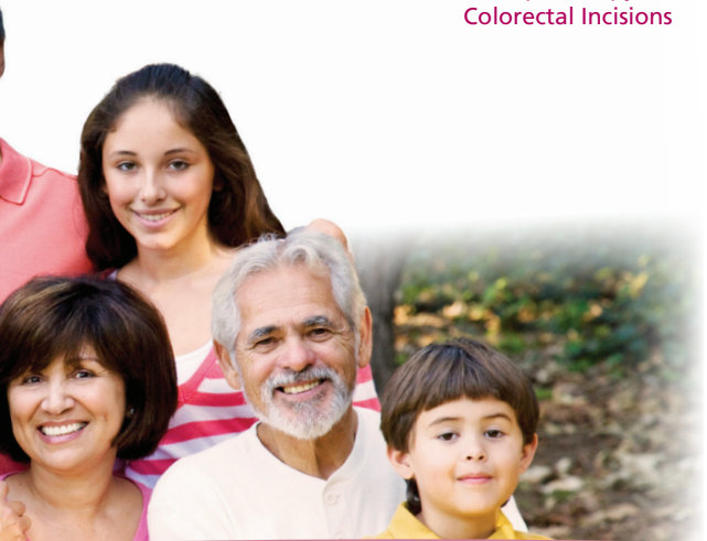
da Vinci Surgery/ Laparoscopy Colorectal Incisions